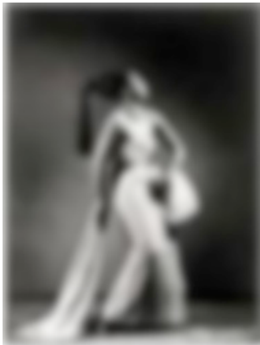
Portrait of Josephine Baker