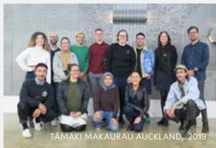
TĀMAKI MAKĀURAU AUCKLAND, 2019