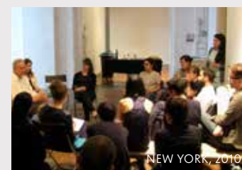
NEW YORK, 2010