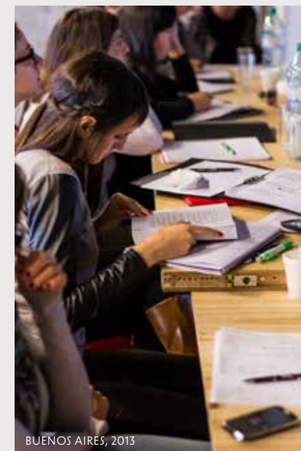
BUENOS AIRES, 2013