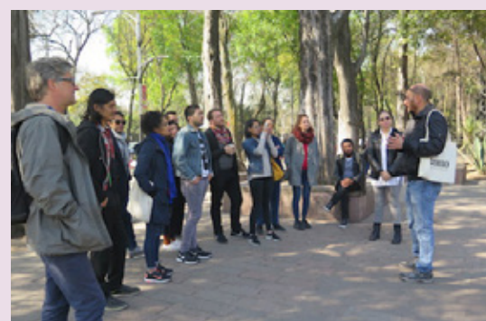
Mexico City, 2018