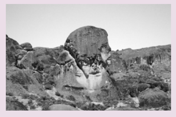
François Bucher The Second and a Half Dimension (An Expedition to the Photographic Plateau), 2010

canonized through collections. This interest is shared by many of the included artists, whose practices of study prompt critical questions about who constitutes our histories and futures, and through what methods.