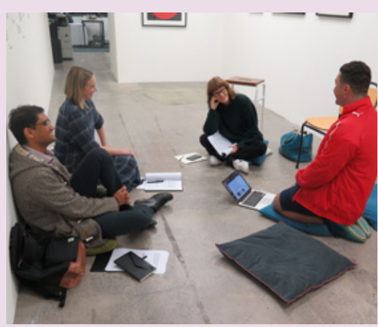
Bangkok, 2018 Auckland, 2019

The Curatorial Intensive supports emerging curators, bringing working professionals together to gain new skills and perspectives on curating. Since 2010, the program has taken place in more than 25 cities around the world, and it has served 500 curators from 72 countries, who form an unparalleled, dynamic network of Curatorial Intensive alumni.