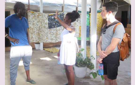
Manila, 2016 Accra, 2017